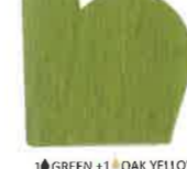
1 GREEN + 1 OAK YELLOW