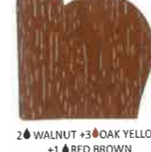
2 WALNUT + 3 OAK YELLOW + 1 RED BROWN