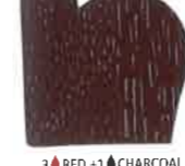
3 RED + 1 CHARCOAL