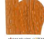
4 OAK YELLOW + 1 TEAK