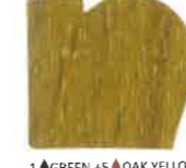
1 GREEN + 5 OAK YELLOW