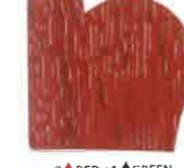
3 RED + 1 GREEN