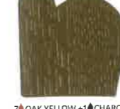
7 OAK YELLOW + 1 CHARCOAL