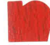
1 RED + 1 OAK YELLOW