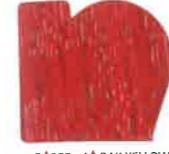
5 RED + 1 OAK YELLOW