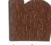
1 GREEN + 1 RED BROWN