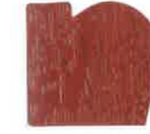
1 TEAK + 1 RED BROWN