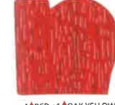
4 RED + 1 OAK YELLOW