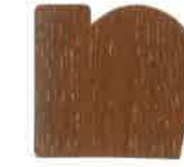
1 GREEN + 1 OAK YELLOW + 1 RED BROWN