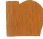
1 RED + 1 GREEN + 8 OAK YELLOW