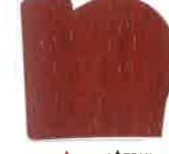
1 RED + 4 TEAK