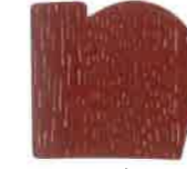
1 WALNUT + 3 RED BROWN + 1 OAK YELLOW