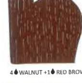
4 WALNUT + 1 RED BROWN