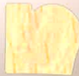
SHADES SHOWN ON NATURAL VENEER