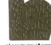
5 OAK YELLOW + 1 CHARCOAL