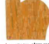
9 OAK YELLOW + 1 RED BROWN