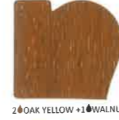
2 OAK YELLOW + 1 WALNUT