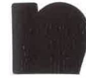
MAHAGONY DARK BROWN