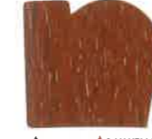
1 WALNUT + 3 OAK YELLOW + 1 RED BROWN