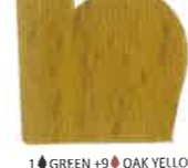
1 GREEN + 9 OAK YELLOW