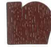
1 WALNUT + 1 RED BROWN