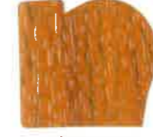
24 OAK YELLOW + 1 RED BROWN