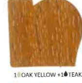
1 OAK YELLOW + 1 TEAK