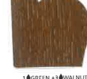
1 GREEN + 3 WALNUT